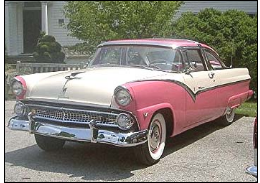
Krupinsky's 1955 Ford Crown Victoria