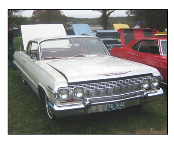
Gary Wilmer's 1963 Chevrolet - Class 36B