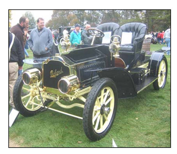
Hershey gives us a chance to see some of the really nice brass era cars that don't come out often. Shown above are a magnificent burgundy 1906 Columbia touring and a black 1905 Packard runabout.