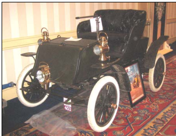
London to Brighton Veteran Car Run 1903 Ford