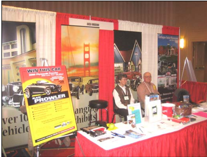
AACA Museum booth featured the Plymouth Prowler Raffle

Plus it has numerous links and reminders. This useful tool can be yours for the asking. All you have to do is call National headquarters (717-534-1910) and give them your e-mail address; or e-mail speedster@aaca.org .