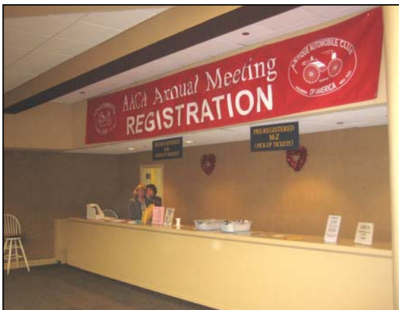
Registration desk on the upper level