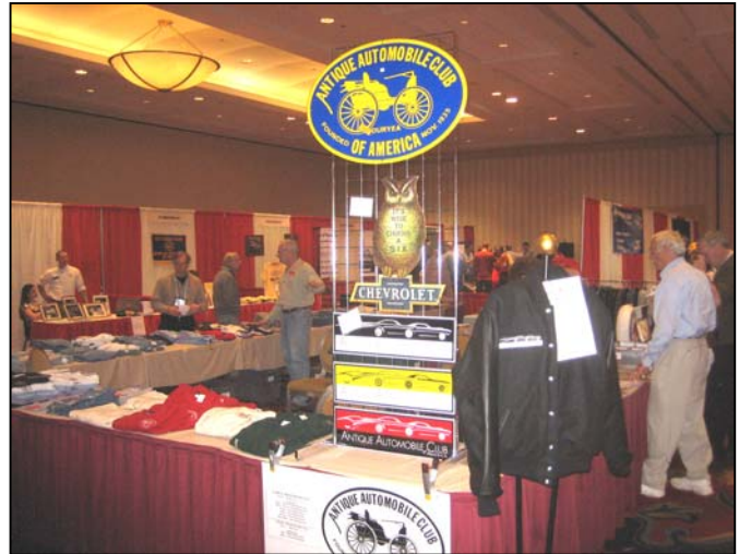
AACA booth with loads of merchandise for sale