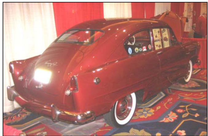
1953 Henry J with original advertising