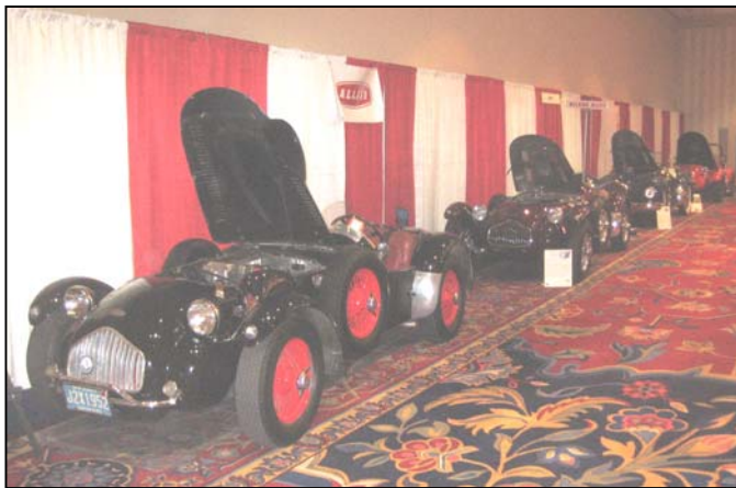
Display of four Allard competition cars 1948 to 1952