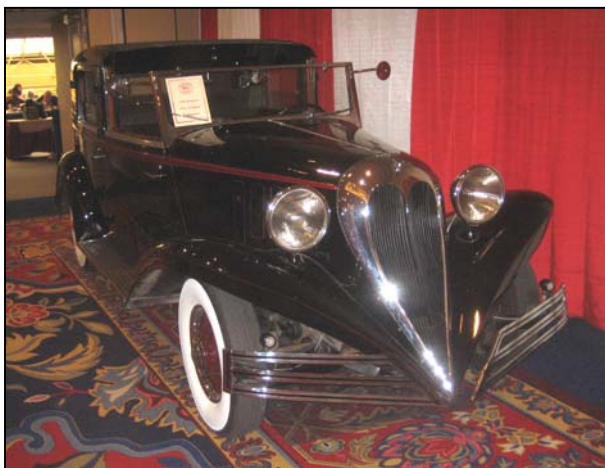
1935 Brewster Town Car on display