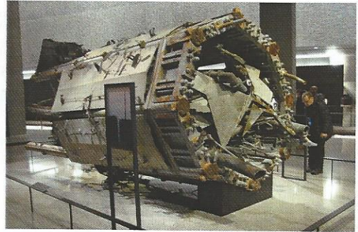
This artifact is about the size of a semi tractor. Although it looks like space junk it is the center section of the antenna mast that was atop the North Tower. It was salvaged from debris at ground zero.