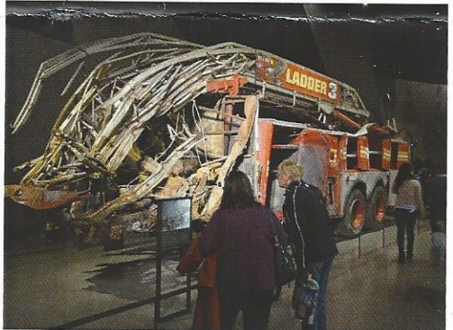
This NYFD Ladder Company 3 firetruck is probably the most iconic display in the museum. It was at ground zero when the North and South towers collapsed.