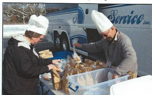
World class chefs prepare a world-class box lunch