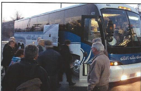
6:45 am at Cromwell Bridge Rd., Park 'n Ride