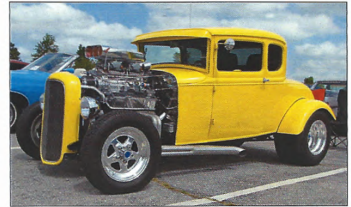
What's a car show without a bright yellow, chopped, tubbed, Ford Model A with a 'big block' Chevy motor and a blower?

The well-attended car show on the grounds of North Carroll High School Panthers drew 127 registered cars, trucks and even a lavishly appointed Peterbilt. The show was sponsored, run and hosted by members of the class of 2016; they did a superb job. Two Chesapeake Region members of the class of 2016 are Todd and Andrew Wilmer.