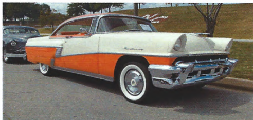
This is a real pretty 1956 Mercury Monterey.