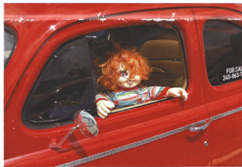
'Chuckie' the terror doll, guards this custom early '40s Ford coupe, while the owner checks out other vehicles at NCHS Car Show, September 5.