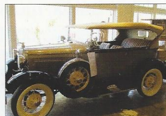
1931 Ford Phaeton Convertible with dual sidemounts