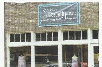
8289 Main Street, Ellicott City