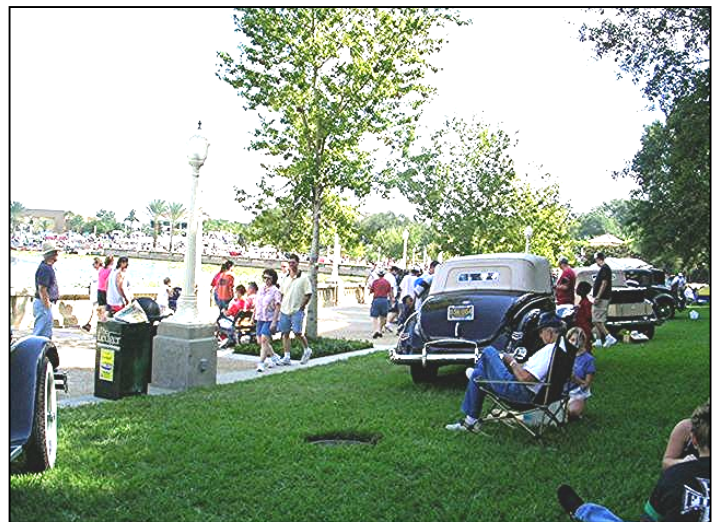
At the Lakeland show, concours cars lined the lakeshore