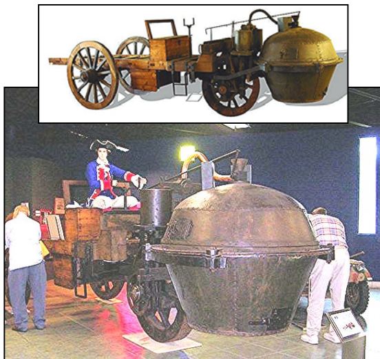
1770 Fardier de Cugnot at the Tampa Bay Museum

The Tampa Bay Automobile Museum opened in