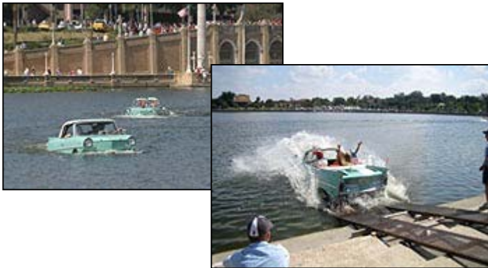
Amphicars are into the water showing what they do best