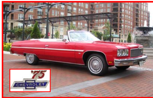
Big Red posing for another photo in the Potomac neighborhood.

Big Red's pristine condition is the result of its unusual history. The original dealer, McDonald Chevrolet & Oldsmobile in Halifax, kept the car for approximately twenty-three years in their showroom, using it only occasionally as a parade car. Built in St. Louis, Missouri, it was one of 420 shipped to Canada (without air conditioning). Another clue that it was destined for Canada is the bi-lingual decal on the rear bumper by the gasoline cap with two warnings: UNLEADED FUEL ONLY in English, followed by the French ESSENCE SANS PLOMB SEULEMENT.