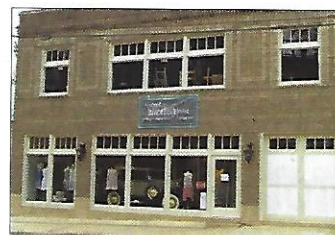
Sweet Elizabeth Jane, boutique

Reference: Ellicott City Times , May 19, 1927.