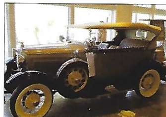
1931 Ford Phaeton Convertible with dual sidemounts