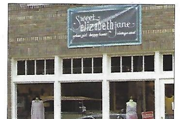
8289 Main Street, Ellicott City